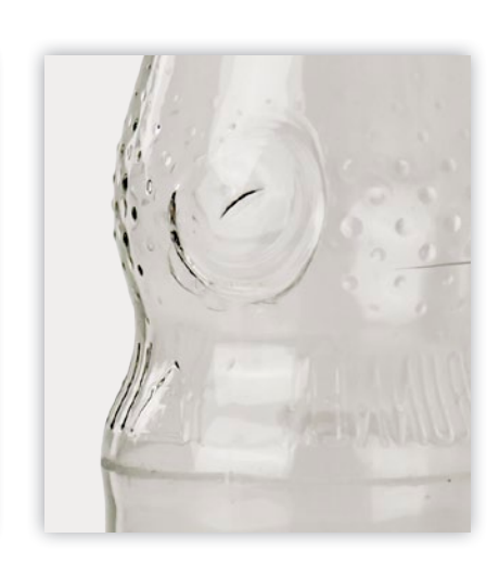
The HEUFT InLine IX identifies glass splinters, thread cracks and shell-shaped fractures, to name but a few.